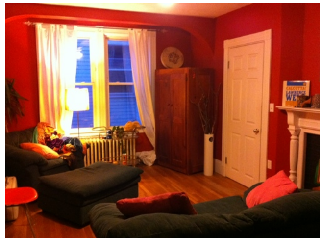
2nd common area+ your closet!