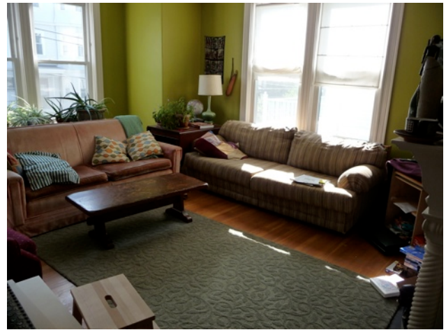
living room/common area

Friendly 2nd-floor apartment in JP (a minute walk from Centre St.. 39 bus and five minutes from Stony Brook train station). Two women in our early-mid thirties live here. Between the two of us, we are artist, student, public health doer, massage therapist, cook, knitter, singer, reader, writer, lover of public radio, drinker of both coffee and tea... The apartment has hard wood floors, a very large kitchen with a brand new stove, a newly renovated bathroom, two living rooms, and a newly built deck overlooking trees and gardens. We are both hard working, progressive, outgoing, and into taking care of our home, and are looking for a queer friendly person who is clean, communicative, and responsible to share our place with. Currently no pets, though a cat is negotiable. On-street parking. Minutes walk to the Brendan Behan, The Haven and Canary Sq! Our landlords are very responsive and thoughtful. Rent is $690 plus utilities.