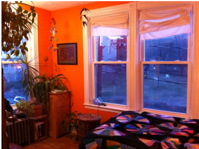
your new room